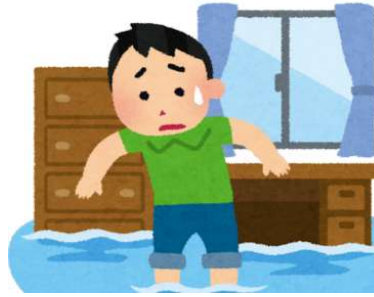
flood ( inundación )