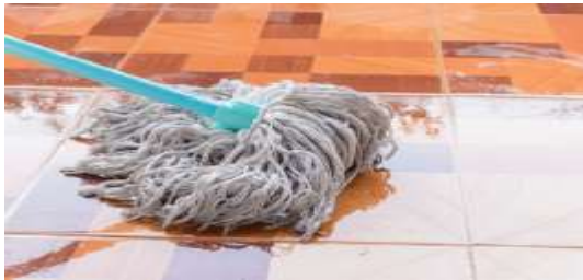
I mop the mud.