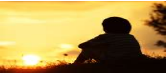
I sit in the sun.