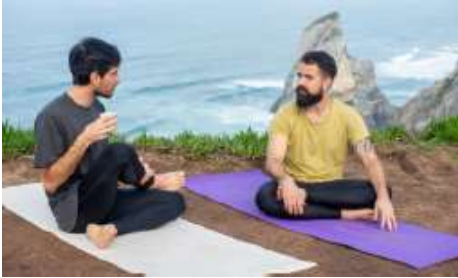
The men sit on the mats.