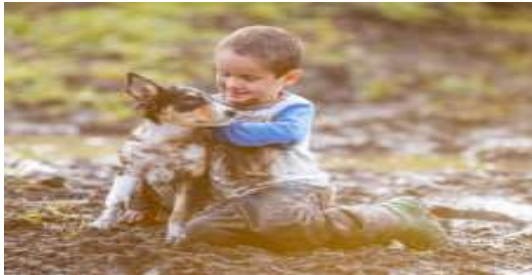
They sit in the mud.