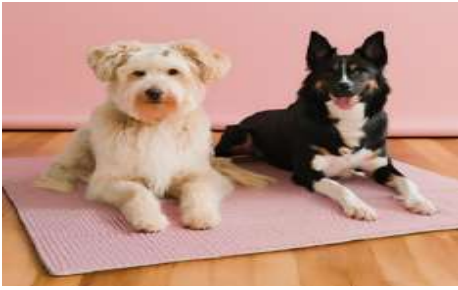
The dogs sit on the mat.