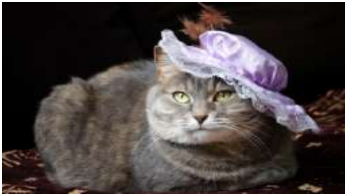
You put a hat on the cat.