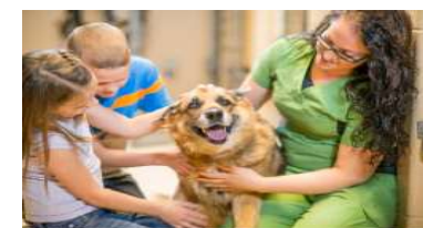
We pet the dog.