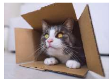
The cat is in the box.