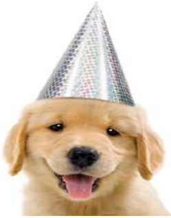
You put a hat on the dog.