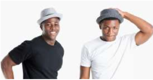
The men put on hats.