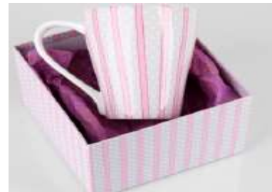
The cup is in the box.