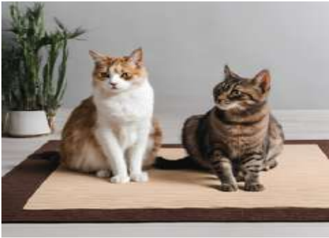
The cats sit on the mat.